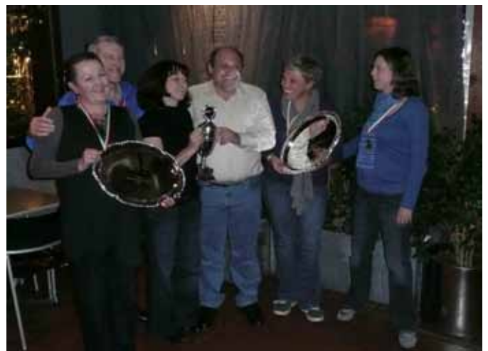
The winners with their trophies in Melbourne